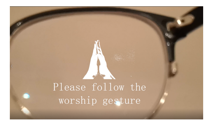
Figure 3: Gesture guide on AR glasses