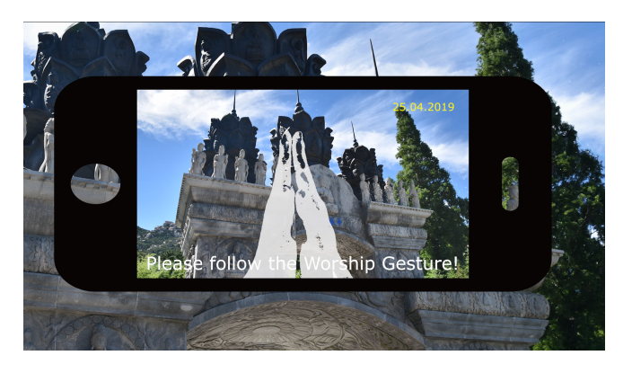
Figure 2: Gesture guide on mobile device

they are moved by the environment, however, without any knowledge, they do not how to behave to communicate to the above. With the help of this application, they have a chance to learn the gesture and process easily and properly. For the simple praying gesture, the system will recognize the situation by the location and POI then show the user the correct worship gesture (Figure 2). As long as the AR glasses equipped with hand tracking algorithms or technique, the system would evaluate how good uses imitate the gesture and give them more advice about how to improve their movements (Figure 3). For the complex praying event, the system would analysis the date of the day and the terrain of the region to provide a most proper praying process, including what kind of material does the user need and what motions needs to be achieved. For example, in Buddhism, different date of the year requires believer to do different setups and do the praying to different immortals. They system would guide the user step by step and evaluate the result of the user's present, which provides them a reference and increases users' engagement.